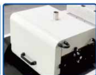
2 times drying system