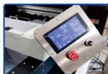
Touch screen of temperature control