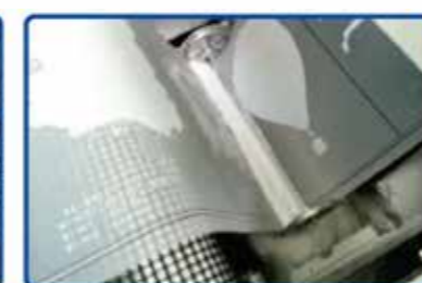
Conveyor belt for PET film