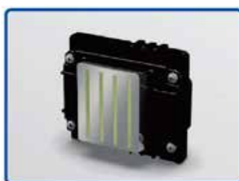
Original Epson i3200 heads